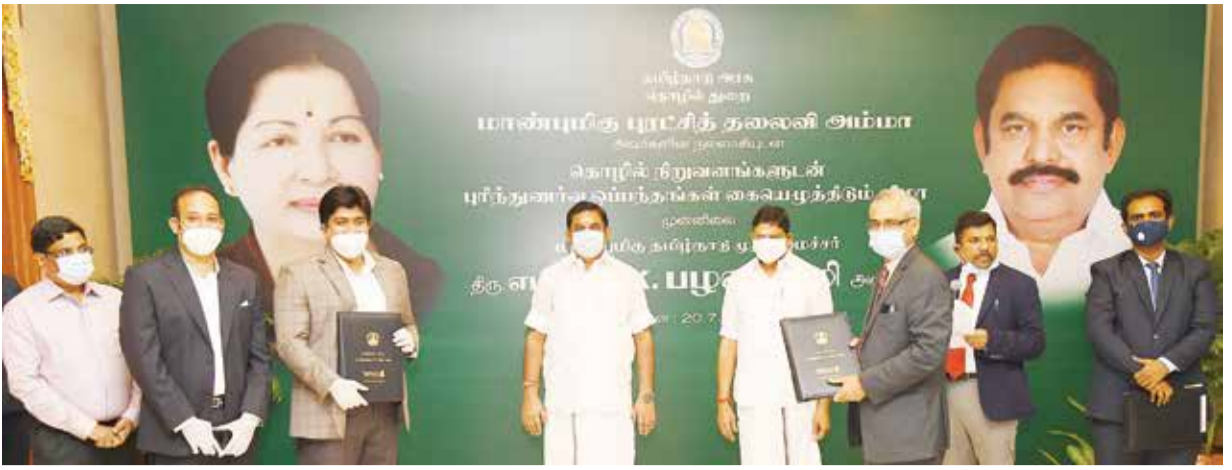
MoU signed with CGD Sathrai Pvt Limited to set up Industrial park in Walajabad in the presence of the Tamil Nadu CM Edappadi Palaniswami, Industries Minsiter M.C. Sampath.