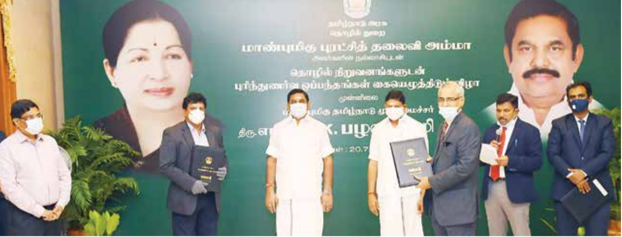
MoU signed with Aquasub to set up Ductile Iron Foundry in Coimbatore in the presence of the Tamil Nadu CM Edappadi Palaniswami, Industries Minsiter M.C. Sampath.